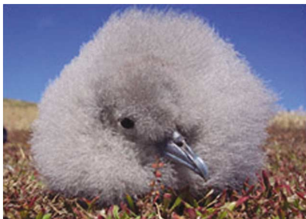
Figure 1. A 22-day-old thin-billed prion chick.

(phenyl ethyl alcohol, PEA: Sigma-Aldrich, St. Louis, Missouri, USA, a rosy-smelling novel odourant, 0.1 \mu M), or control (distilled water) solutions to 40 eggs (20 per treatment) using an artist's paint brush (Sneddon et al. 1998). The eggs were painted every other day for a total of 4-5 applications per egg, depending on hatch date. We have previously shown that petrel chicks can detect this odourant (Cunningham et al. 2003), but are relatively unresponsive to it in behavioural trials (Cunningham et al. 2006). Of these eggs, 12 PEA-treated and 11 control-treated chicks hatched; hatch failure fell within normal limits (Weimerskirch pers. com).